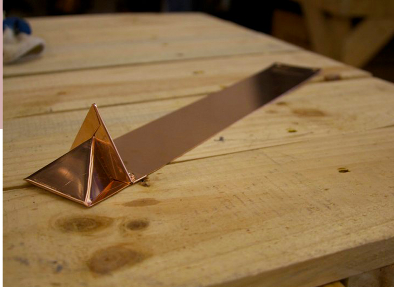
Standard Snow Guard Layout